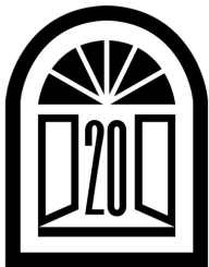
Jay County Public Library 1996-2016

You can also look forward to some great opportunities for interacting with other library users with activities like library mini-golf and a pumpkin book character contest. We invite you to share your memories of the library too, about the preparation for the building project, construction and first visits to the building, as well as telling everyone "Why I Love My Library."