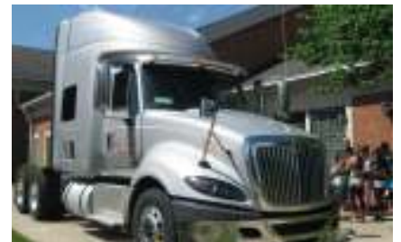
And look what parked at the library for one of our Monday kids' programs!