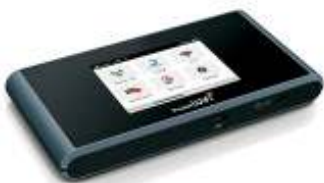
Mobile hotspot is roughly the size of a phone.

Beginning July 11th cardholders 18 and older can check out a mobile hotspot for seven days. One renewal is possible when there is no waiting list. The device will be shut off when it becomes overdue. You will be able to place a hold on a hotspot like any other item in the catalog. Just search for “hotspot.”