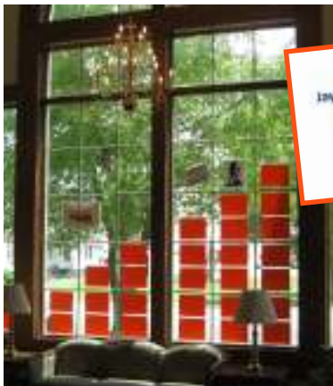
The climber's making progress.