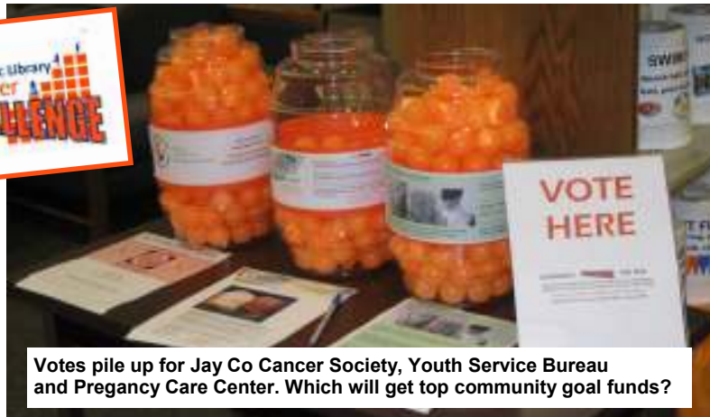
Votes pile up for Jay Co Cancer Society, Youth Service Bureau and Pregnancy Care Center. Which will get top community goal funds?