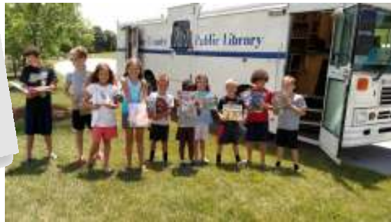
Happy bookmobile borrowers at Hudson Park.

Look what's up at the library— and on the road.