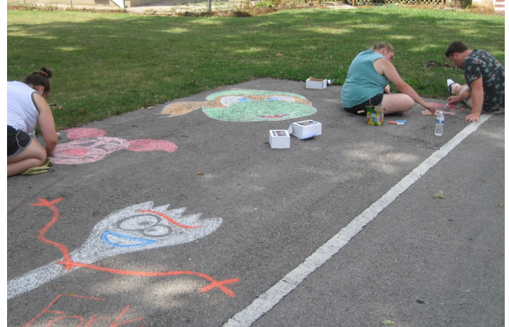
Patrons working on decorating the parking lot.

Those who completed a Challenge Card were entered in a raffle - we gave away Wal-Mart and Chamber of Commerce gift cards to our lucky winners.