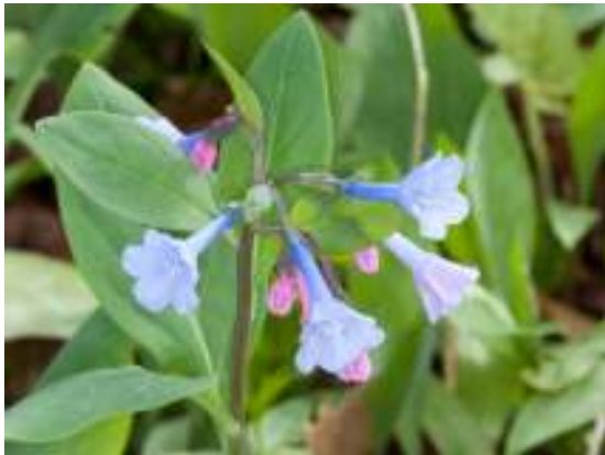
It may be called a Virginia bluebell (Mertensia virginica) but it's listed as native to Indiana by the Indiana Native Plant & Wildflower Society.

Bring your questions and come ready to be inspired.